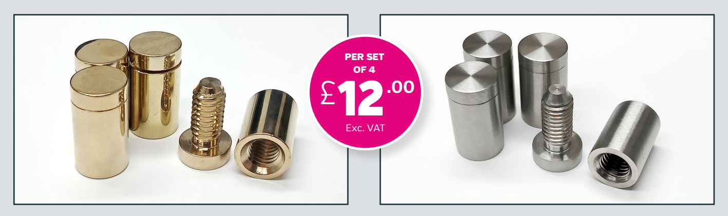
CSL03998 - Polished Gold Stand-Off Wall Mounts 13mm Diameter - 19mm Long